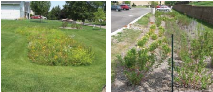
Rain gardens can be a visually appealing way to maintain water quality in both residential (left) and commercial (right) settings.

Rain gardens are all the rage these days. People seem to love them or hate them, but often their perspective is based on having seen attractive rain gardens – or the opposite. The decision to incorporate rain gardens into land development is best based on a full understanding of what they are, when they are beneficial, and how to make them effective and appealing.