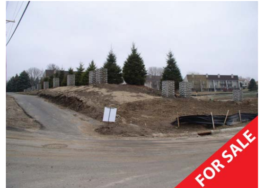
Fig. 1.0 Real Estate Due Diligence Reports and Services

Initial research and analysis: Many property owners and speculators know enough about real estate and land development to conduct a preliminary assessment. Due diligence will be most efficient when consultants are hired to take care of the more advanced steps.